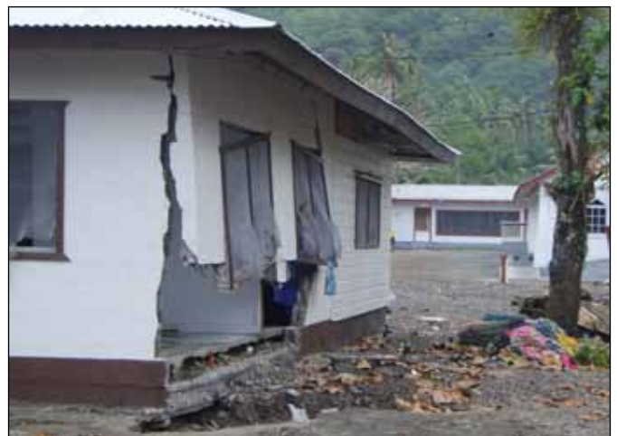
Figure 5: This CMU residence withstood most of the force of the tsunami except for an area at the back. It appears that some scouring of the foundation may have weakened the connection of the CMU walls at their base. The water passing through the house and trying to exit through small window openings would have created large forces on this wall.