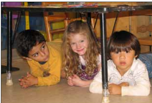
Preschool practice drill at the YMCA in Santa Barbara, California.

For more information, visit http://www.michelbruneau.com/MB-Literature.htm . The book can be ordered for $15.99 plus shipping from Amazon.com .