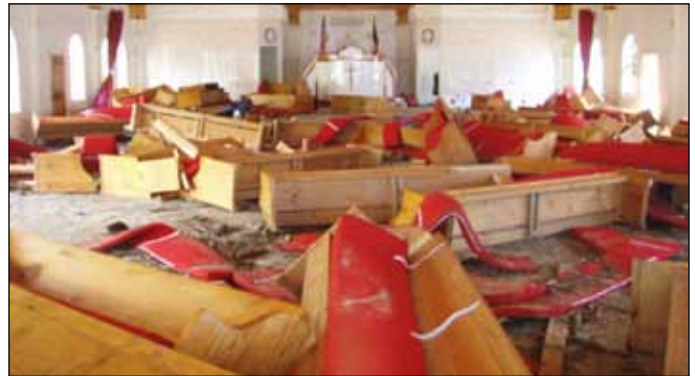
Figure 2: Many of the low-lying villages have churches near and facing the ocean. The typical construction is a combination of concrete frames and concrete masonry unit (CMU) infill. In several cases, the tsunami entered churches through the front door and flowed out the windows along the sides of the church. While doors, windows, and interior furniture were damaged, the structures did not appear to have any distress from the hydrodynamic loading. This picture shows the pews having been ripped from the slab as the tsunami flow rushed through the church.