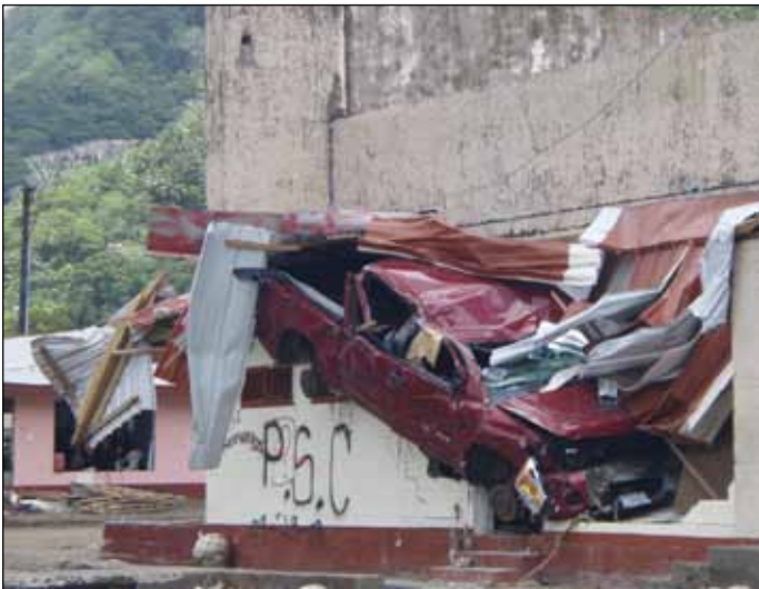
Figure 3: In addition to damage from the tsunami, floating debris such as vehicles and empty shipping containers caused localized damage to buildings.