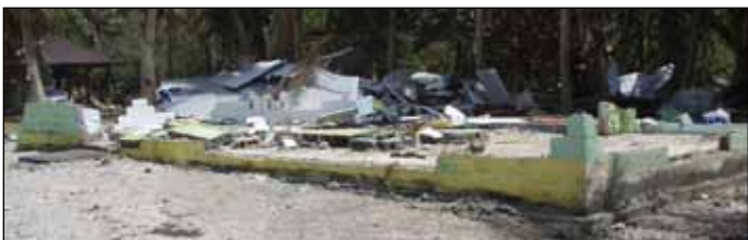
Figure 4: While most CMU buildings withstood the tsunami, those that were poorly constructed did not fare well. The house in this picture was leveled to its foundation, while other nearby masonry buildings survived. Many of the block cells in the walls of this building were not grouted, including many that had reinforcing steel in them.