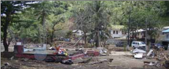
Figure 1: Within the inundation zone, most of the wood-framed residences were leveled down to the foundation.

support to a team that traveled later in October to investigate emergency and coastal management issues. Baldrige provided the photos on this page. For more information, visit http://www.eqclearinghouse.org/20090929-samoa/ . A more complete special report will be included in a future Newsletter .