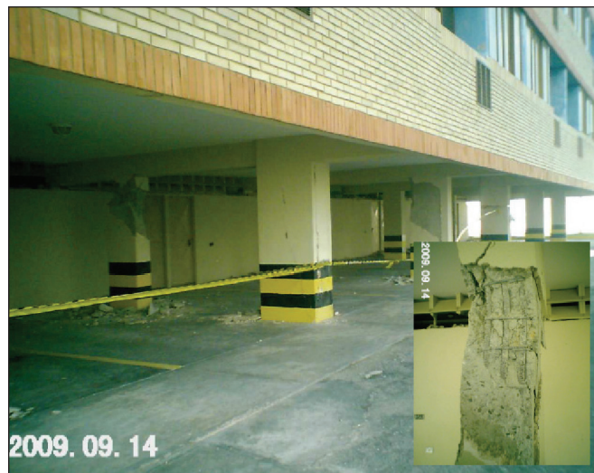
Figure 3. Loss of the concrete cover and bulging of rebars in base columns in building in Tucacas.