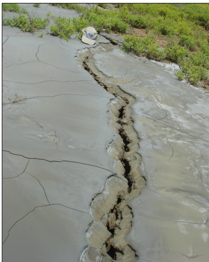
Figure 2. Typical liquefaction.