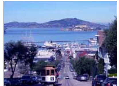
A cable car climbs Hyde Street in San Francisco, with Alcatraz in the background.

Attention undergraduates: We encourage academic and student members to let undergraduates know that the 7th Annual Undergraduate Seismic Design Competition will be held during the Annual Meeting (see enclosed poster).