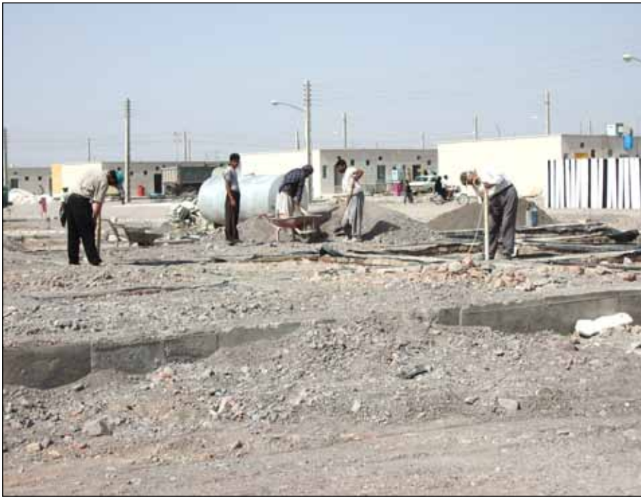
Figure 5. Temporary housing under construction.

cooling; daily temperatures are currently over 100 degrees. Tent residents must use collective toilets and showers.