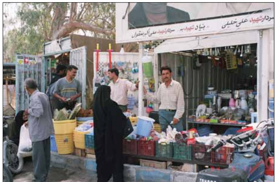
Figure 2. Temporary small businesses. Note containers in background, used for business and storage.

Residential damage: Damage to residential structures was very severe, leaving approximately 95% of the homes within the city of Bam and a large proportion of dwellings in the surrounding villages uninhab-