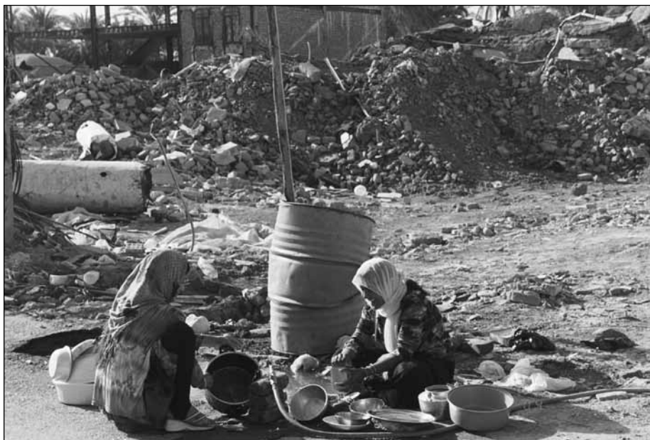
Figure 7. Life goes on in Bam, as women wash cooking and eating implements in a ditch.