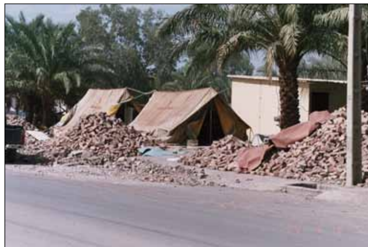
Figure 4. Tent shelters placed among piles of debris. Some residents are still living in tents next to debris from their homes.

Temporary housing and residential reconstruction: At the time of this reconnaissance visit, the vast majority of displaced households were still living in tents, most of which had been provided by the Red Crescent Society. At the insistence of residents, the majority of these tents had been placed on private property near homes that had been destroyed. Other tents were erected in congregate camps, while still others were located on streets adjacent to former dwellings. Tent camps are being used mainly to house former renters and migrants from the nearby villages. The tents are very small, and the vast majority have no capacity for