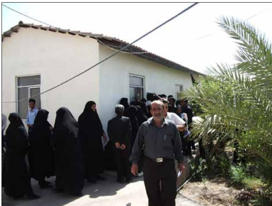
Figure 8. Residents queue up daily to request urgent recovery assistance at the headquarters of Bam's regional governor.