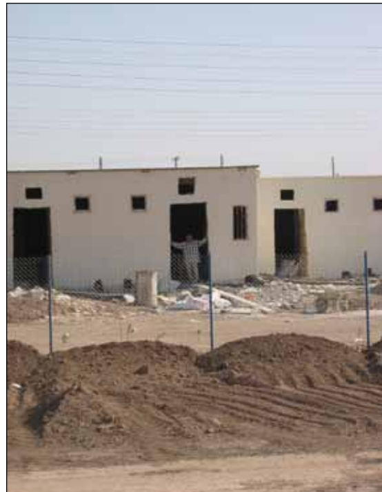
Figure 6. Resident looks out from temporary housing structure. Although units are still under construction and not approved for occupancy, some families have already moved in.

Government agencies will provide a range of services to residents, from debris removal and site preparation to design review, inspections, and the enforcement of price controls to prevent price-gouging. At the same time, homeowners will be able to choose home designs and building materials, within constraints set by reconstruction authorities. Housing reconstruction is already underway in the villages surrounding Bam. Much of this work is being