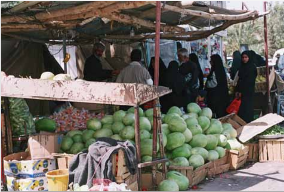
Figure 3. Temporary market. Many businesses now operating in Bam were not doing business in the city before the earthquake.

itable. Nearly all of the housing in Bam and in eight to ten villages within 10 km of Bam must be replaced. Adobe and nonengineered buildings accounted for 80% of the residential building stock. Additionally, rapid and uncontrolled development in recent years resulted in the construction of many unsafe buildings.